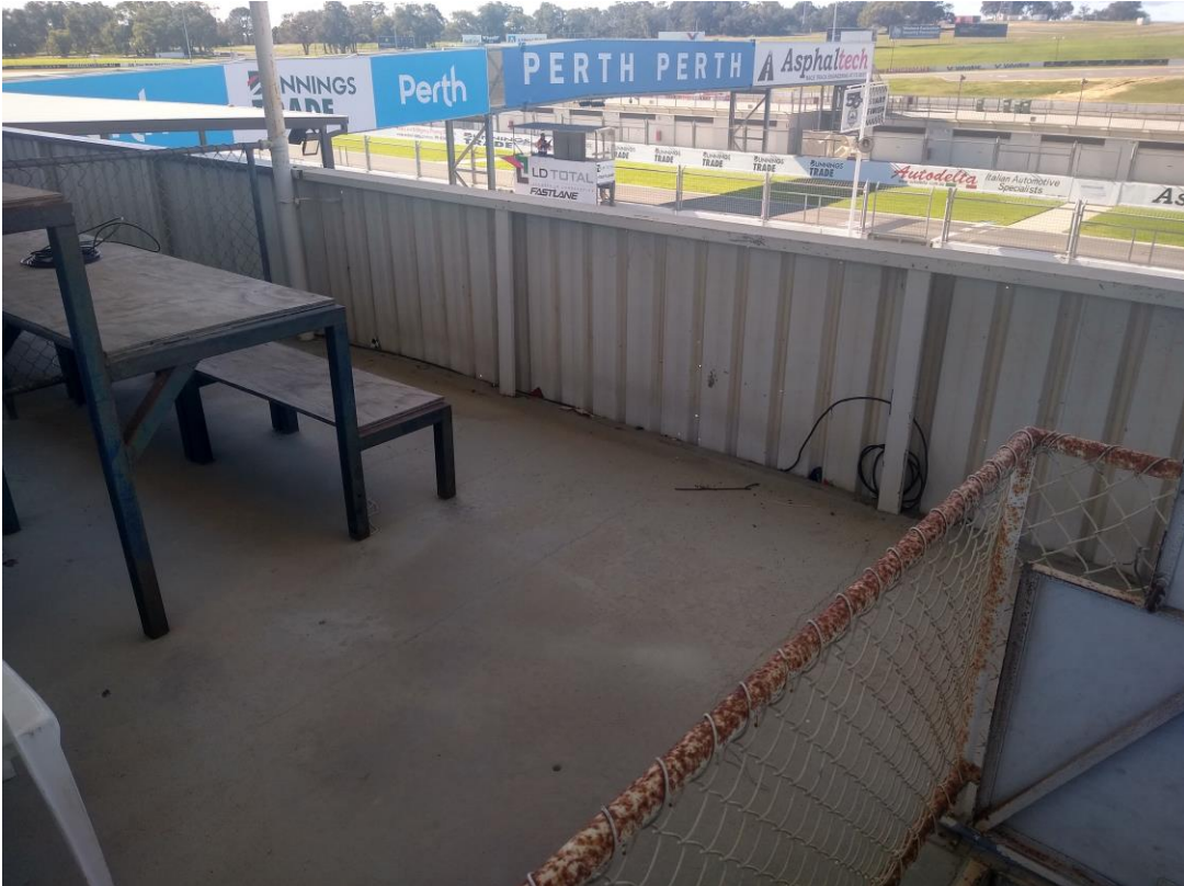
The viewing balcony.