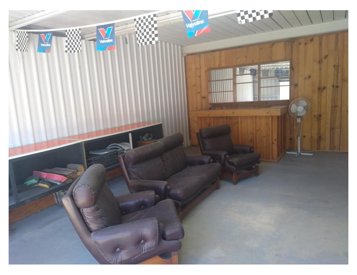
Comfy leather lounge chairs to relax and watch the footie in between races!