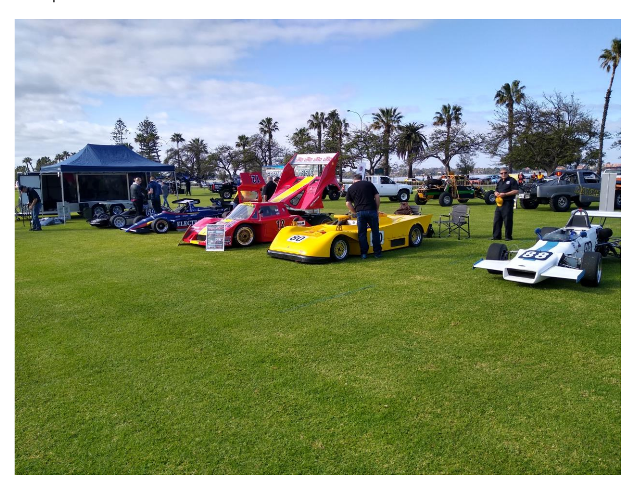
2021 FCR display

FCR has been invited again this year to put 6 cars on display at the Celebration of Motorsport at Langley Park on Sunday 11<sup>th</sup> September 2022. Would any member keen to display their car at this event please contact me.